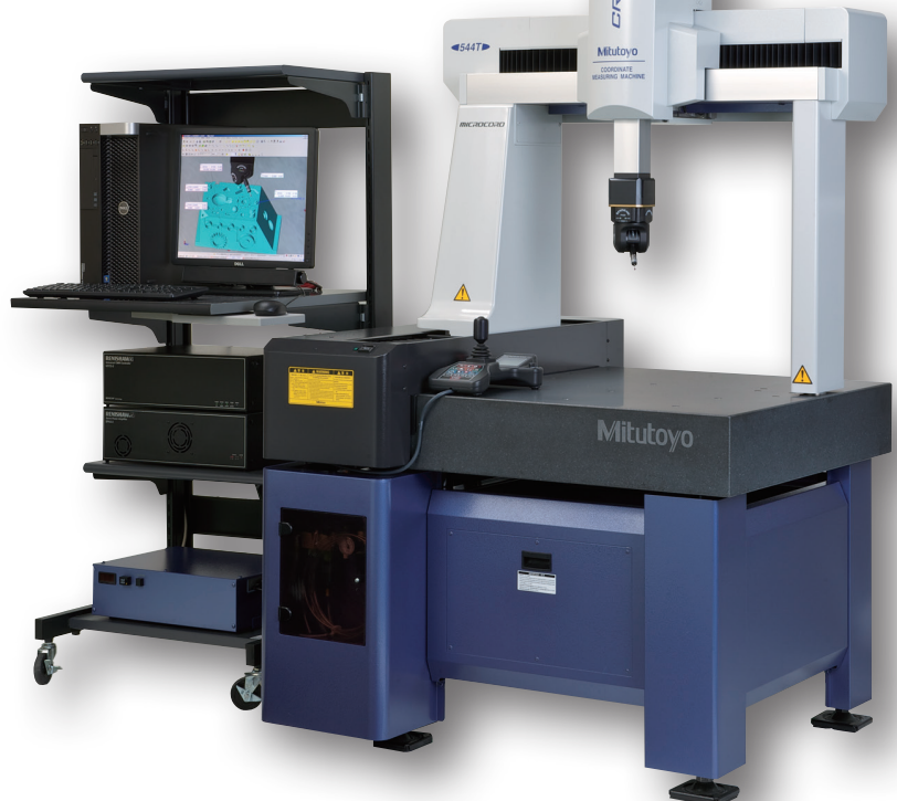
CRYSTA-Apex EX 544T