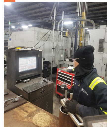
The internal diameter of a pipe is checked for being within spec using a Mitutoyo Indicator, and the data is displayed in real time on a monitor on the shop floor. Data displayed in real time allows for better, faster quality control on the manufacturing floor.

As a result of installing MeasurLink®, Pinnacle has seen their reject rate drop from 3 percent to 1.3 percent.