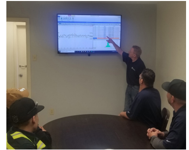
MeasurLink displays measurement data for Statistical Process Control (SPC) analyzing what-if scenarios with historical data, making Pinnacle's quality control process more efficient and accurate.

Pinnacle is beginning to use MeasurLink's Histogram chart, a commonly used SPC chart, which displays capability indices such as Cpk and Ppk to predict how many defects per million they should expect if they were not going to make any changes. Additionally the chart shows the distribution and location of their measurement data with respect to the tolerance. This can easily let operators and engineers know what process adjustments need to be made.